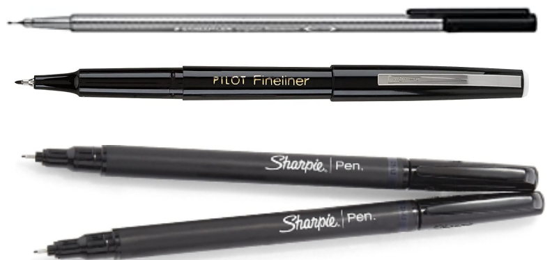
Examples of fine liners