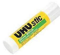
UHU Glue Stick 21g