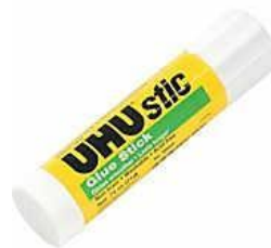
UHU Glue Stick 21g