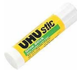
UHU Glue Stick 21g