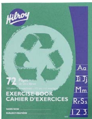
½ plain, ½ interlined scribbler