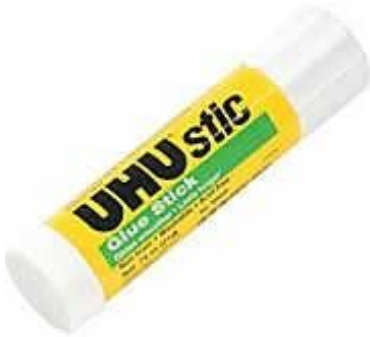
UHU Glue Stick 21g