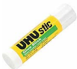
UHU Glue Stick 21g